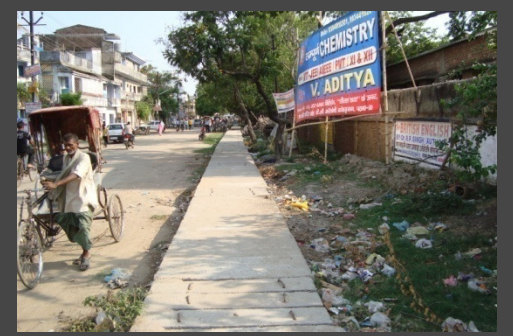
Completed lateral Drains