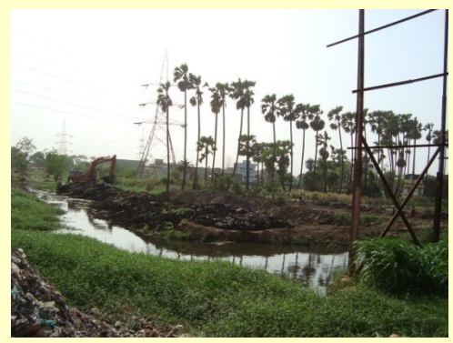
Outfall - Before